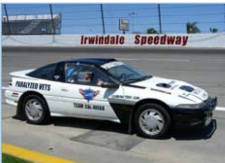
Pararally Race car