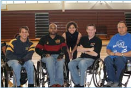
Community Outreach at Francis Parker Middle School