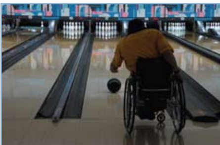
Rolling & Bowling for Dollar$$