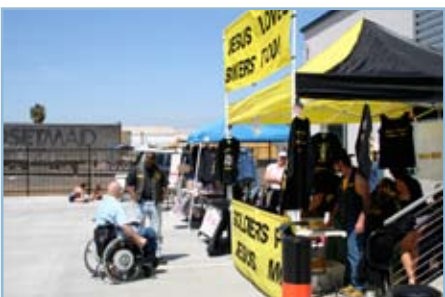
Ride, Strive, and Roll