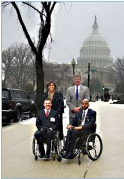
D.C. Delegation, 2007